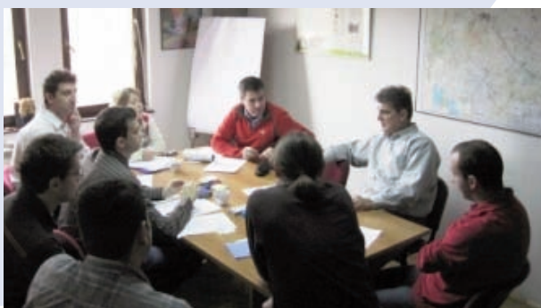
MAC-NEN project team.

The project team went through and analysed all the project objectives and activities and constructed a comprehensive implementation plan. One of the key outcomes of the meeting was the development of a detailed National Awareness Raising Campaign Plan which defines the key target groups, the messages to be addressed to them and means of delivering those messages.