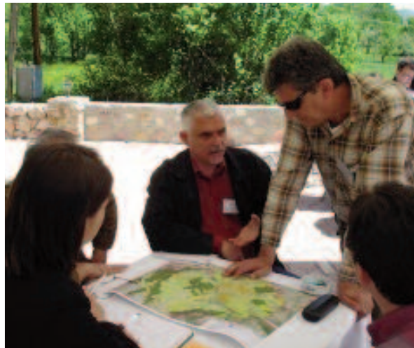
Workshop participants examining the draft map of the National Ecological Network.