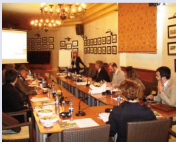
The SEE-BAP Steering Committee

During the meeting the project team presented the project goal, specific objectives and plan of activities. The discussion focused on how to create synergies with ongoing programmes and activities and avoid duplication of efforts in a region where many donors fund development and environmental projects. Particular attention was given to the coordination of activities with other relevant projects funded by the Finnish Ministry for Foreign Affairs and other donors in the Western Balkans. The discussion also covered monitoring and evaluation of the project and how to ensure that the processes it engenders will continue after project completion.