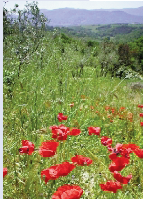
The conference participants focused on actions to preserve Europe's remaining wild areas.

For more information, including the full 'Message from Prague', visit the conference website www.wildeurope.org/