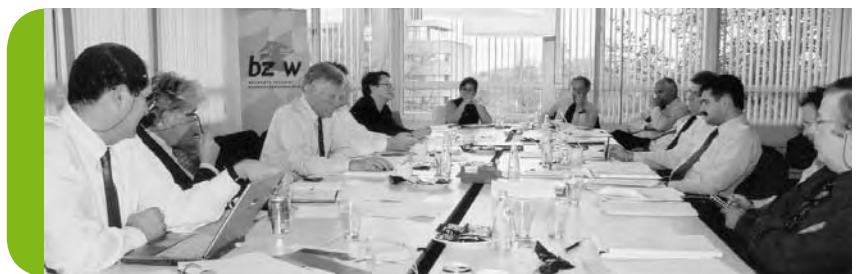
ECNC Board members at the November 2005 meeting.

The Annual Board meeting was held in Tilburg on 11 and 12 November 2005. The Board decided to strengthen ECNC's role as a European biodiversity expertise centre for sustainable development, while stressing the foundation character. The Board adopted a midterm strategic orientation.