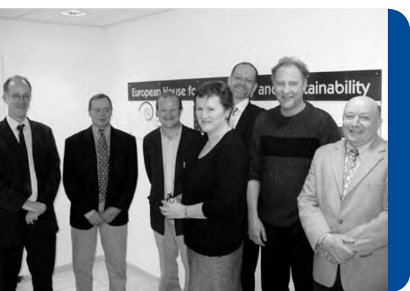
The ECNC Scientific Council: (left to right)